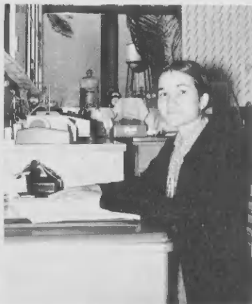
Miriam Oduber Medical